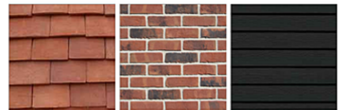
Red Roof Tiles Red Multi Brick Black Weatherboarding