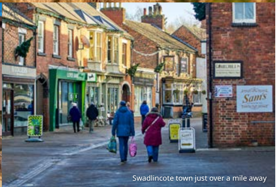
Swadlincote town just over a mile away