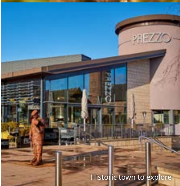
Historic town to explore

Conveniently located with a wide range of public transport options nearby, including bus and train services. For journeys further afield, East Midlands airport is just 25 minutes away.