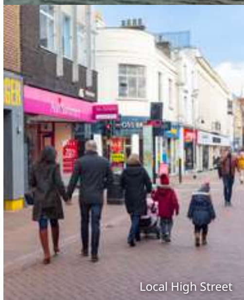
Local High Street