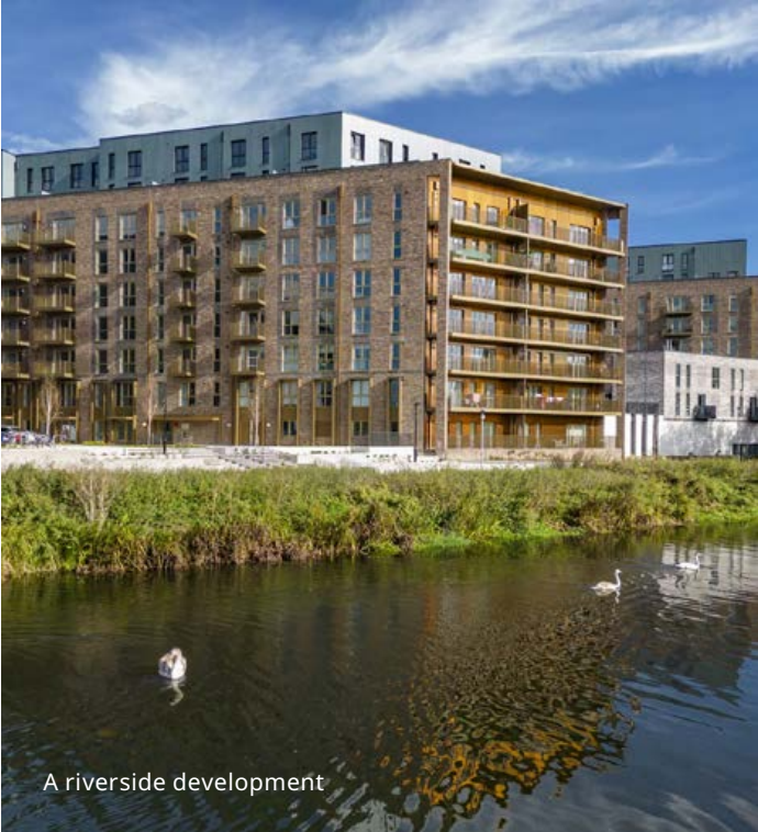
A riverside development