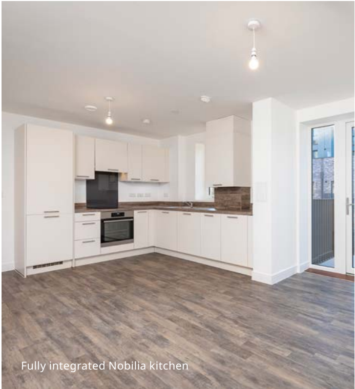
Fully integrated Nobilia kitchen

Located by the waterside in Chelmsford, Aspyre offers the best of modern living, where residents can escape the buzzing city and retreat into nature. Aspyre is a commuter's dream, being a short distance away from excellent road and rail links, as well as direct services to London Liverpool Street. Close by are a variety of leisure, nightlife and shopping opportunities, where independent shops and well-known restaurants sit side by side.