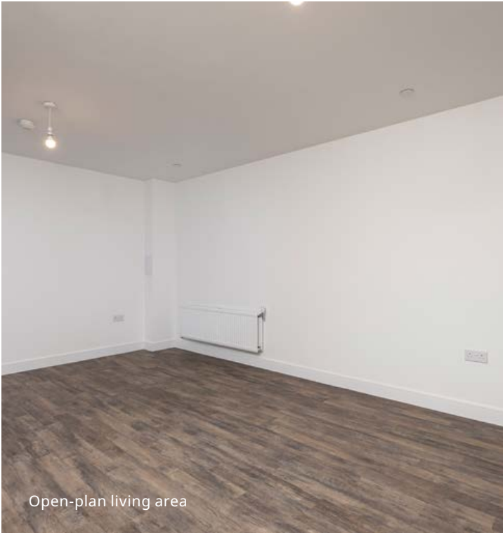
Open-plan living area