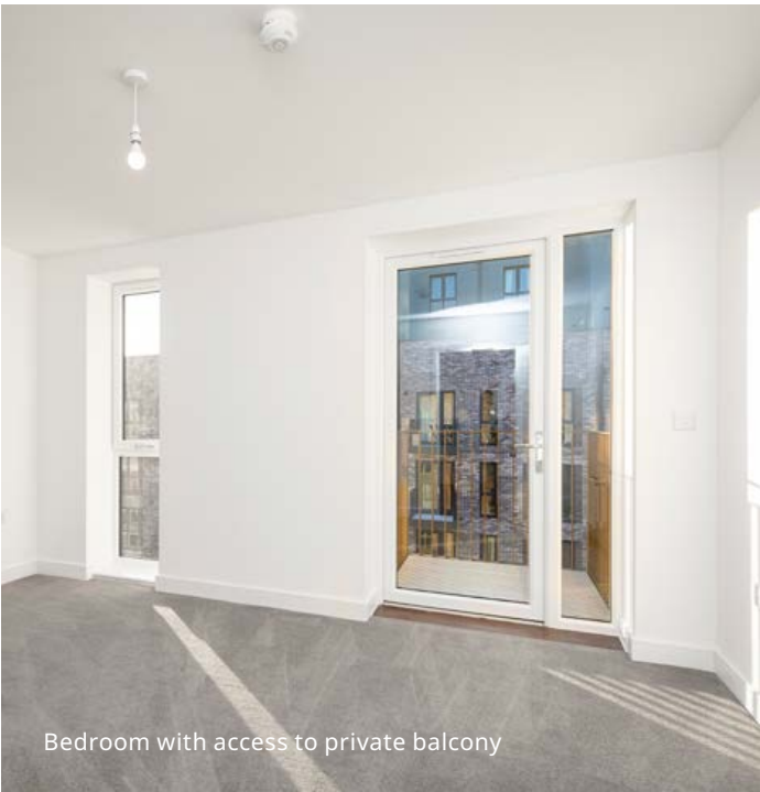
Bedroom with access to private balcony