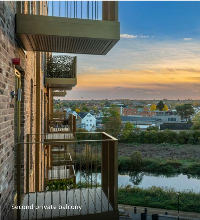
Second private balcony