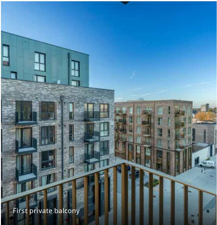
First private balcony