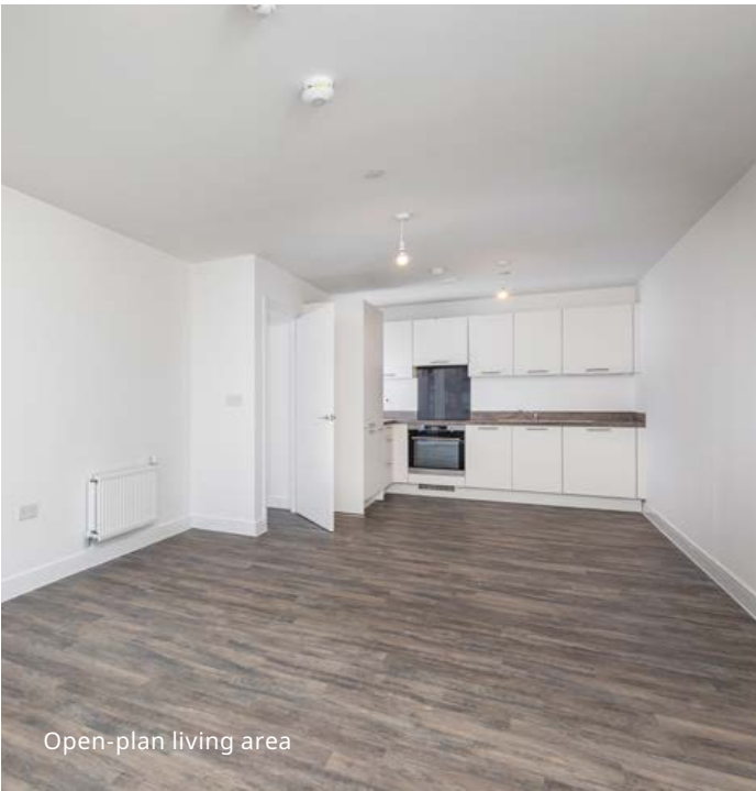
Open-plan living area