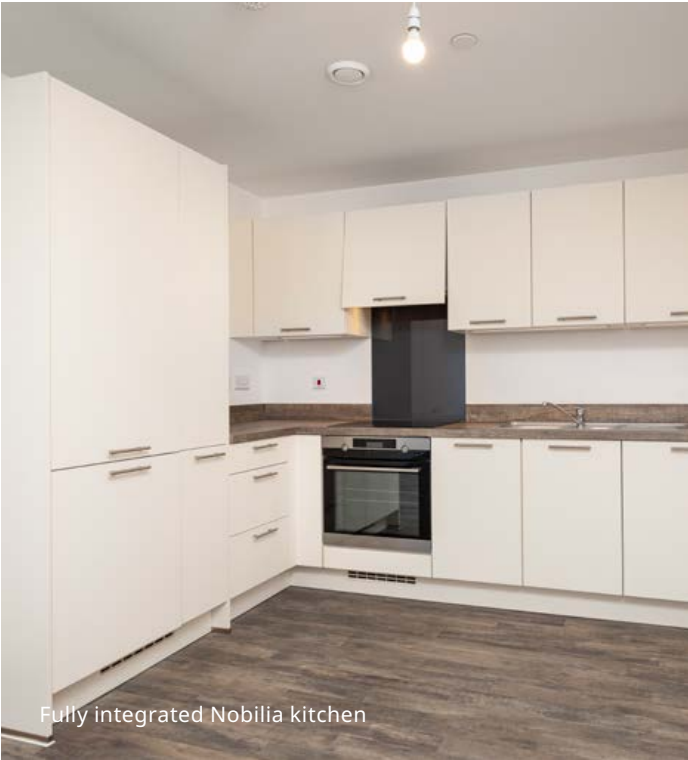
Fully integrated Nobilia kitchen