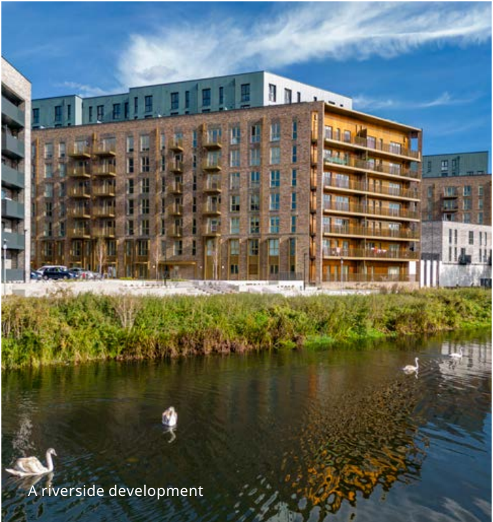
A riverside development