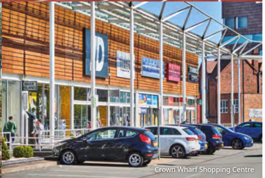
Crown Wharf Shopping Centre