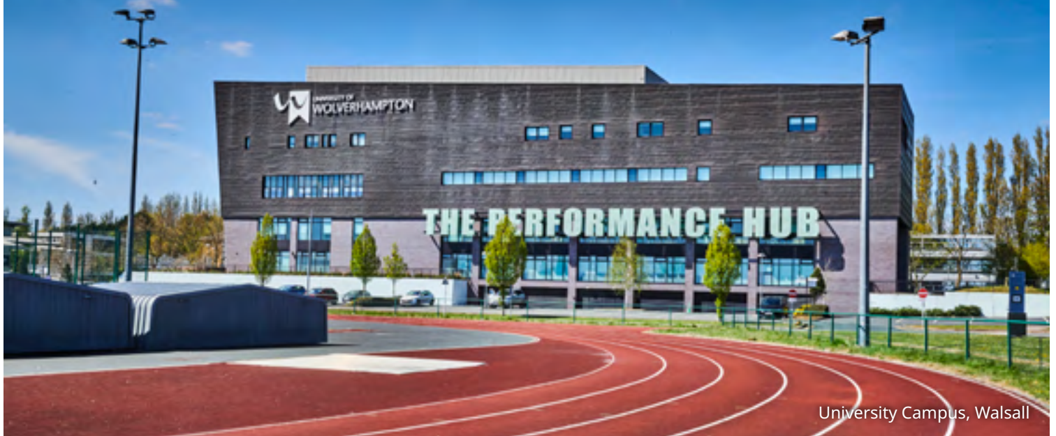
University Campus, Walsall

Walsall is becoming one of the most popular shopping destinations in the Black Country, with an abundance of high street shops, supermarkets, restaurants and bars for everyone to enjoy. For those who like to enjoy a bit of culture, you could take a visit to Walsall Leather Museum or the New Art Gallery Walsall, which features works by Van Gogh and Monet. Alternatively, you could visit the nearby market town of Bloxwich, where you'll find a number of high street shops, pubs and restaurants.