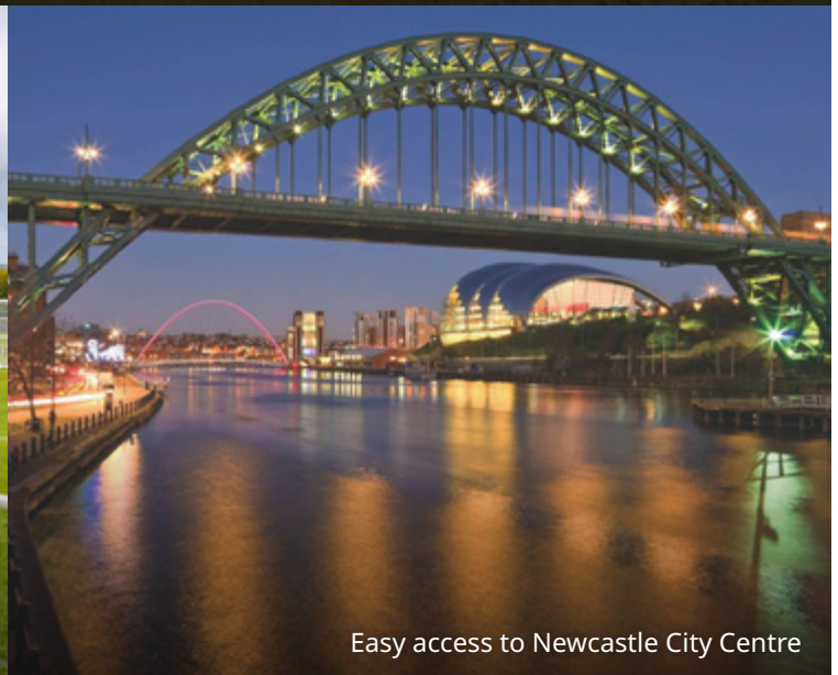
Easy access to Newcastle City Centre