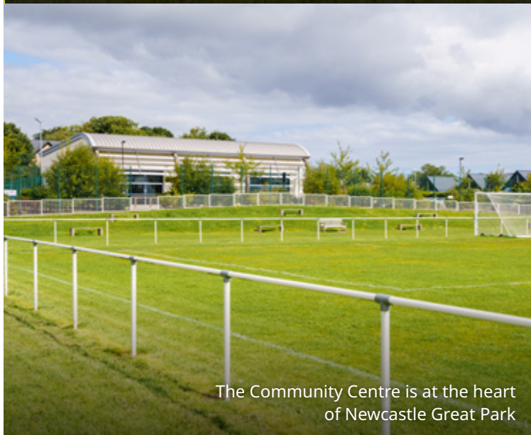
The Community Centre is at the heart of Newcastle Great Park