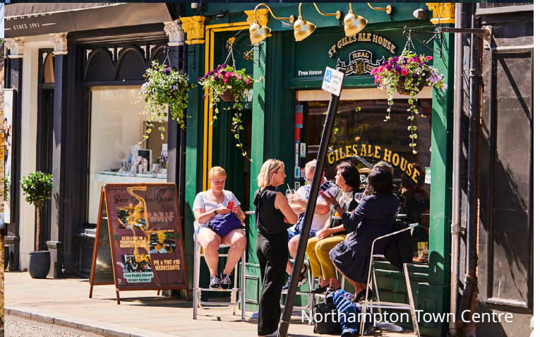
Northampton Town Centre