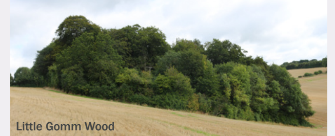
Little Gomm Wood