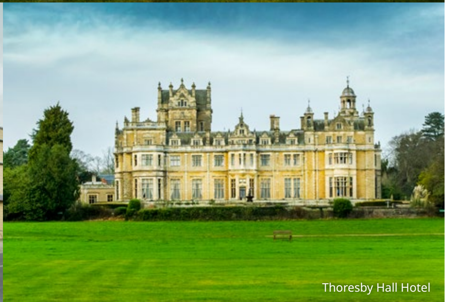
Thoresby Hall Hotel