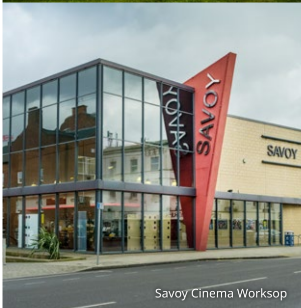
Savoy Cinema Workshop

The border town of Dinnington sits to the east of Sheffield in the historic West Riding of Yorkshire. Dinnington High Street is home to a variety of stores, including small independent traders and an indoor market. The small town centre also offers a choice of pubs, restaurants, bars and cafes. For those who enjoy the great outdoors, Rother Valley Country Park is the perfect day out for the whole family, with activities including canoeing, golfing, cycling and bird-watching.