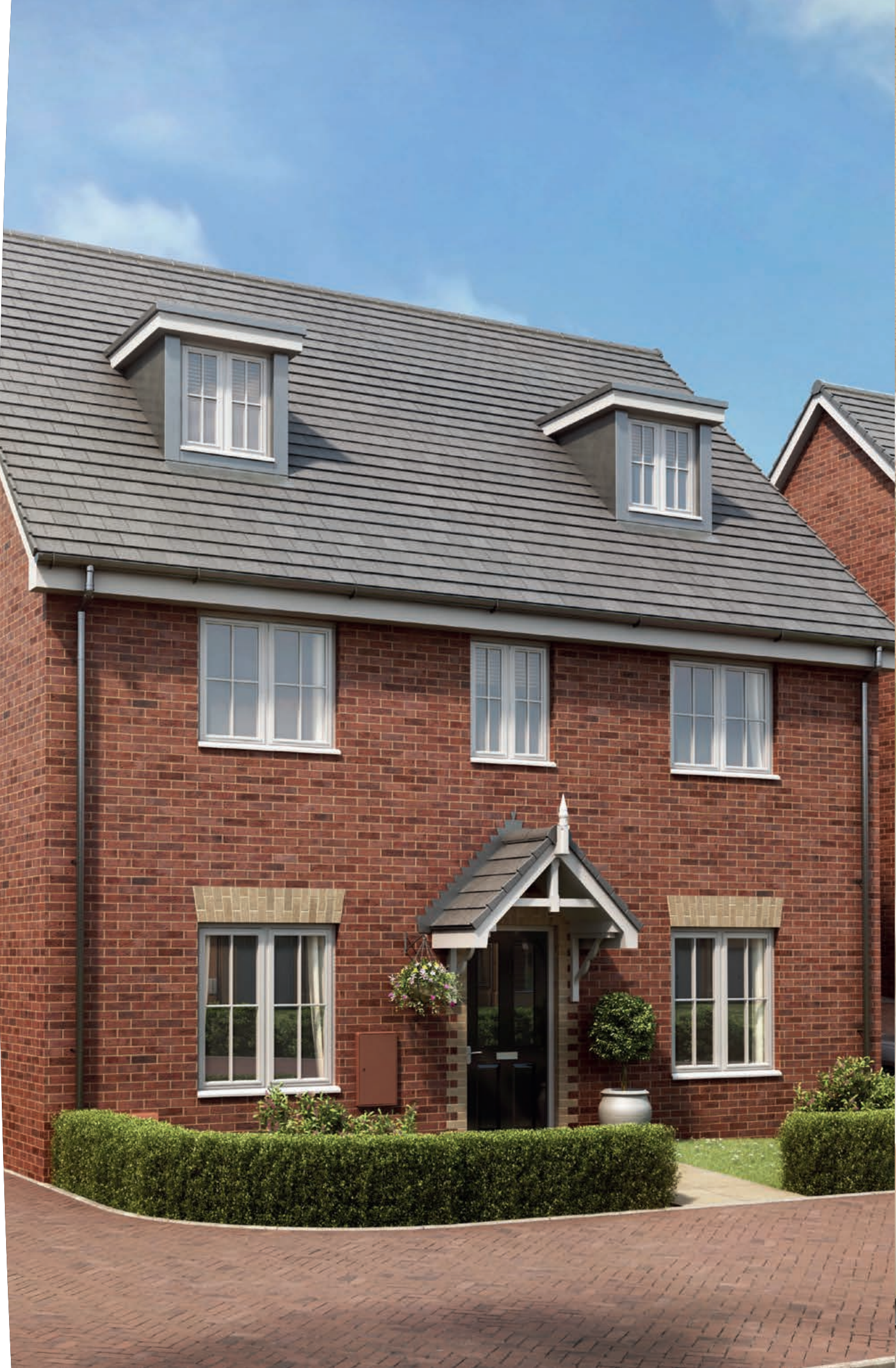
Typical Garrton home shown.

You are welcomed to the second floor with a spacious landing, with ample room to set up a secondary desk space to work from home. An additional two bedrooms also feature, as well as a shower room.