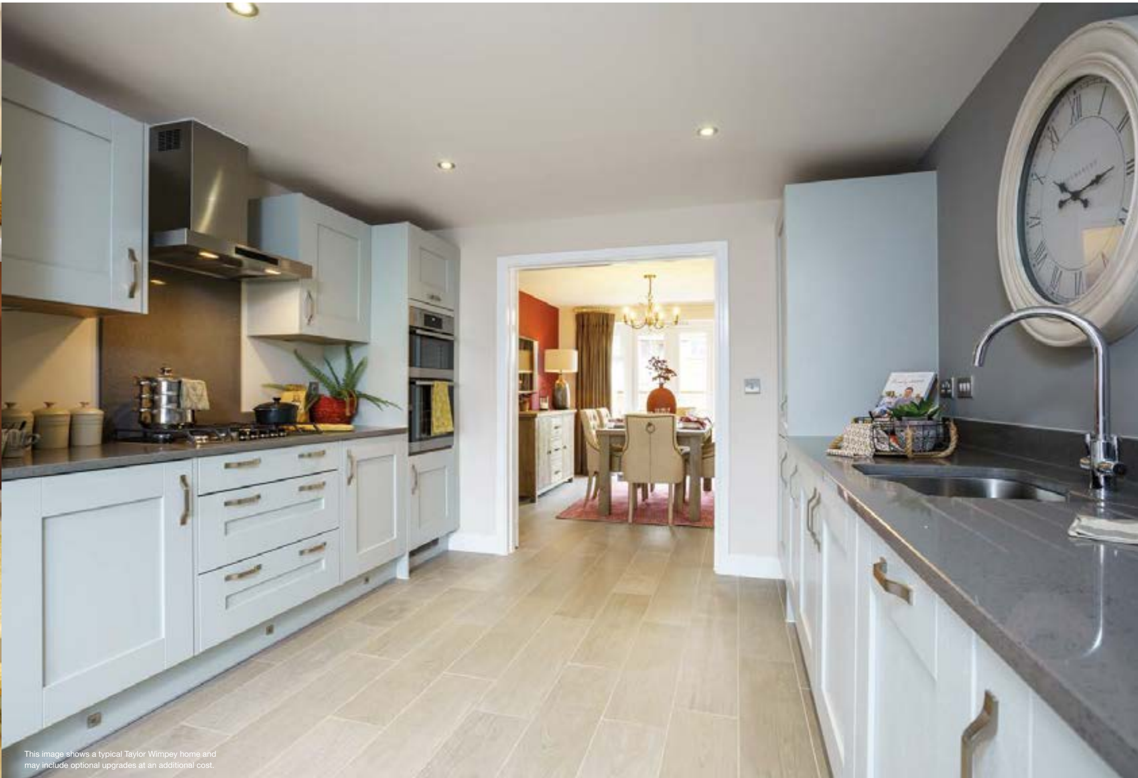
This image shows a typical Taylor Wimpey home and may include optional upgrades at an additional cost.