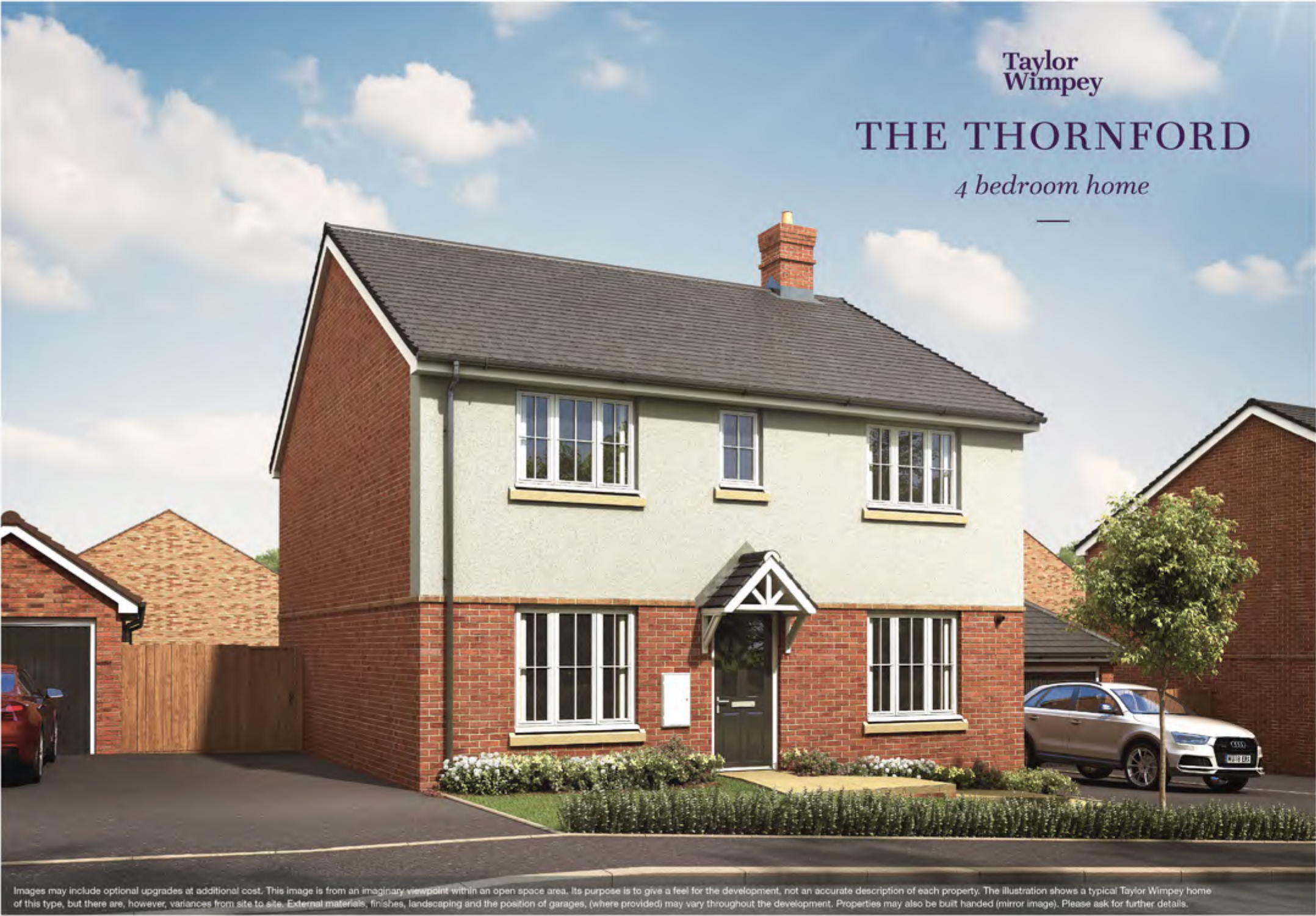
Images may include optional upgrades at additional cost. This image is from an imaginary viewpoint within an open space area. Its purpose is to give a feel for the development, not an accurate description of each property. The illustration shows a typical Taylor Wimpey home of this type, but there are, however, variances from site to site. External materials, finishes, landscaping and the position of garages, (where provided) may vary throughout the development. Properties may also be built handed (mirror image). Please ask for further details.