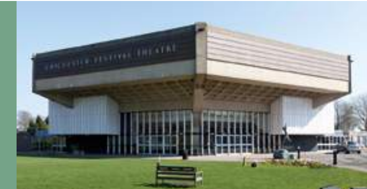
Chichester Festival Theatre is one of the UK's flagship theatres, renowned for the exceptionally high standard of its productions as well as its work within the community.