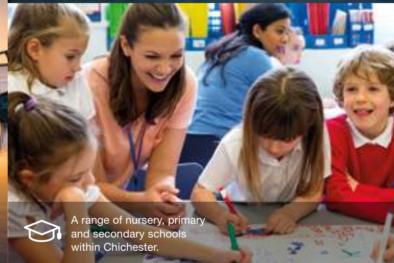
A range of nursery, primary and secondary schools within Chichester.