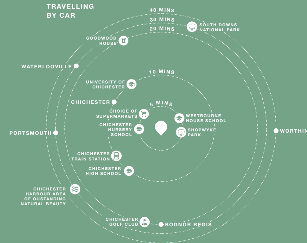
Maps shown are not to scale. Times, distances and directions are approximate only and are taken from google.co.uk/maps and southernrailway.com.

Of course, home life is only part of the story. You'll want stress-free connections to other parts of the country too. So it's good to know Shopwyke Lakes has fantastic road links – the A27 and A3(M) are easily accessible, meaning a trip into Southampton or Brighton couldn't be easier, plus Southampton Airport can be reached in 40 minutes. Meanwhile, Chichester railway station is under two miles away and connects to London in 1 hour and 30 minutes.