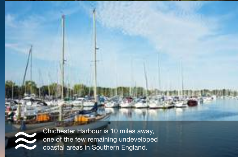
Chichester Harbour is 10 miles away, one of the few remaining undeveloped coastal areas in Southern England.