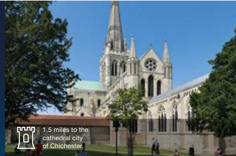
1.5 miles to the cathedral city of Chichester.

Those who love the outdoors can enjoy the beautiful coast and countryside, while nearby Goodwood provides anything from a quiet round of golf to the thrills of horse racing and motorsport. Add a great selection of nearby schools and colleges and you have the perfect place for all the family.