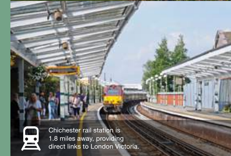
Chichester rail station is 1.8 miles away, providing direct links to London Victoria.