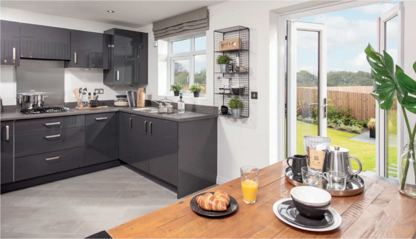
Typical Gosford home shown