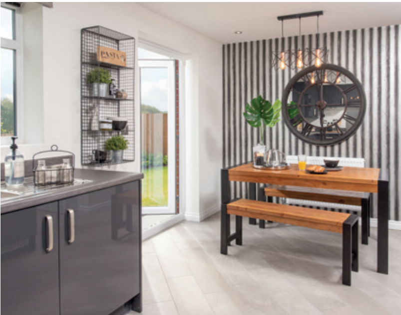
Spacious open-plan living. With a large kitchen and dining area, it feels sociable and is the perfect place for sharing your culinary creations with friends and family. The French doors connecting you to the outdoor space.