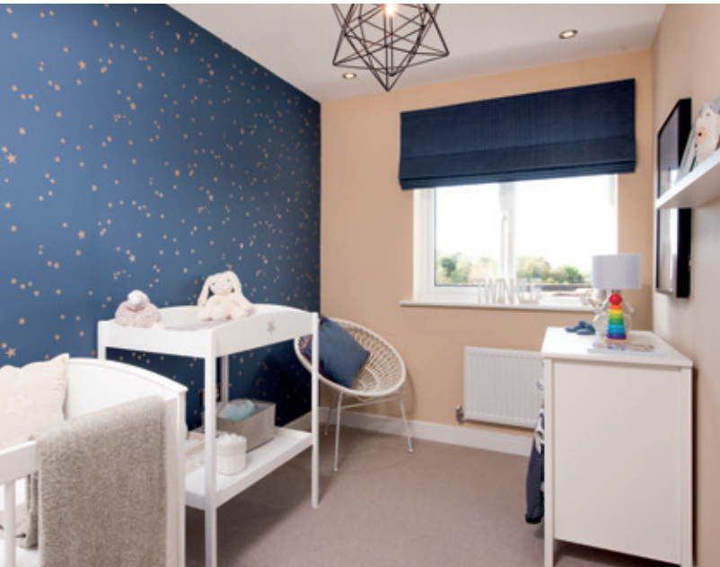
There is space for a third bedroom, which could be used as a nursery or playroom. Equally, it could double up as a home office or be turned in a walk-in wardrobe. Perhaps even a tranquillity room for yoga and relaxation.